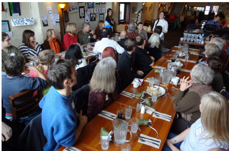
Volunteer Appreciation Luncheon at Boundary Bay Brewery, December, 2012.