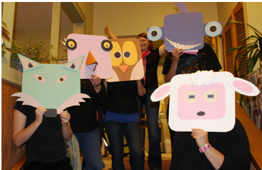
Eagleridge Elementary assembly presentation, September, 2012.

“I have used an I statement with my mom and it really kept the situation calm and helped our relationship stay strong.”