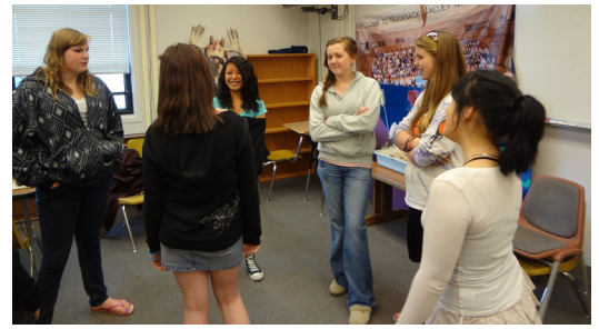
Nooksack Valley Middle School, May, 2012.

Our youth program empowers young people to resolve conflict without aggression and build healthy relationships.