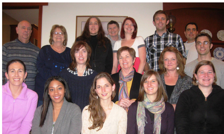
Annual Board/Staff Retreat, December, 2012.